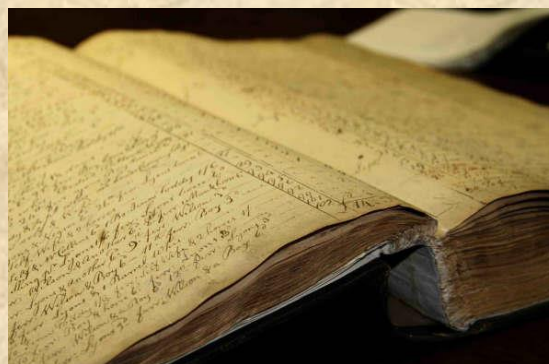
Old Stone Tavern Ledger found in the Special Collection's Room at the Carnegie Library, Main Branch