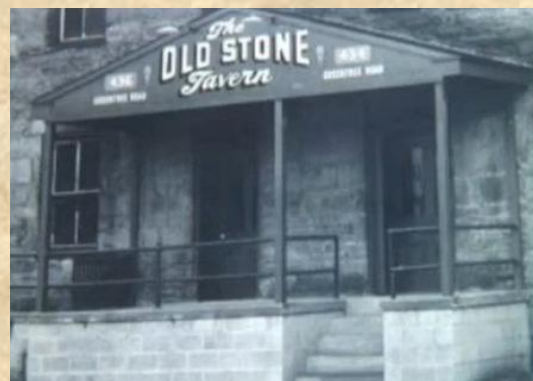
Undated photo of the Old Stone Tavern