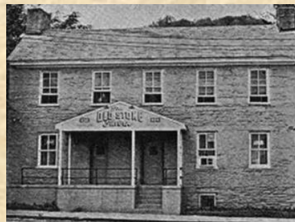
Old Stone Tavern

As noted in their brochure, the tavern has "served and was built on the foundation of what is Pittsburgh. It is a value to the culture of the Pittsburgh Community and can continue to be so if given a chance."