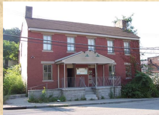
Above, Tavern as it appears today. Left, Tavern decorated for a patriotic holiday—from the early 1900s.